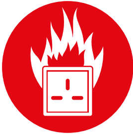
Hot plugs and sockets